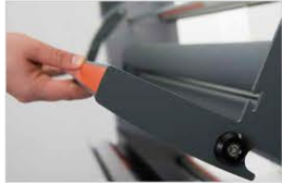
Swing-up steel feed table for quick set-up