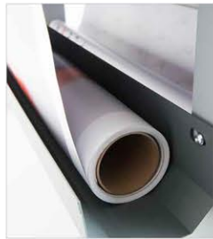
Front tray for prints (optional)