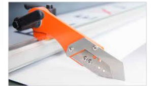
Rear table with cutting unit (optional)