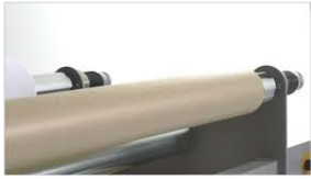
6 shafts for materials: 3 motorized rewinding shafts with clutch and 3 unwinding shafts with brake