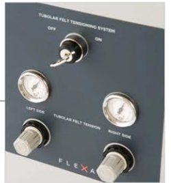
Pneumatic felt belt tension setting, independent left and right