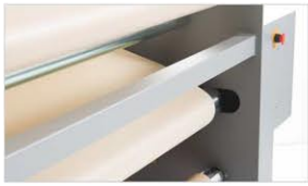
High quality felt belt with automatic tracking