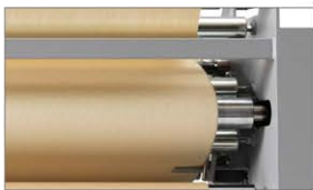
Exclusive oil filled drum that allows you to work even with damaged resistances