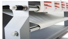
Frontal table on wheels easily attachable to the calender with motorized rewinding and unwinding shaft for the sublimation paper (Sublimax 170 T model)