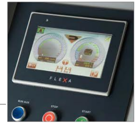
Digital colour touch-screen display with easy-to-use and intuitive control panel